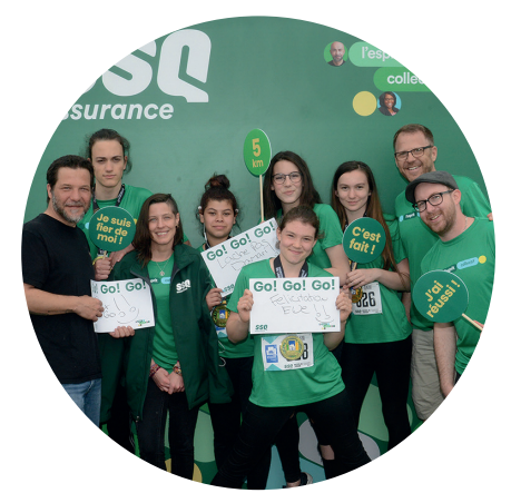
Participation of children from La Maison de Jonathan in the 5K Marathon SSQ Assurance de Longueuil (Montreal area).